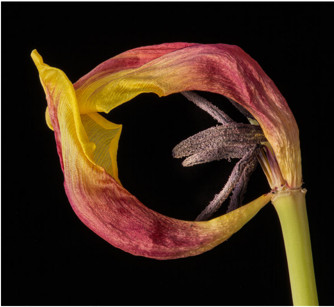
Doug Wolters- Elegant Imperfection “A Graceful Demise”