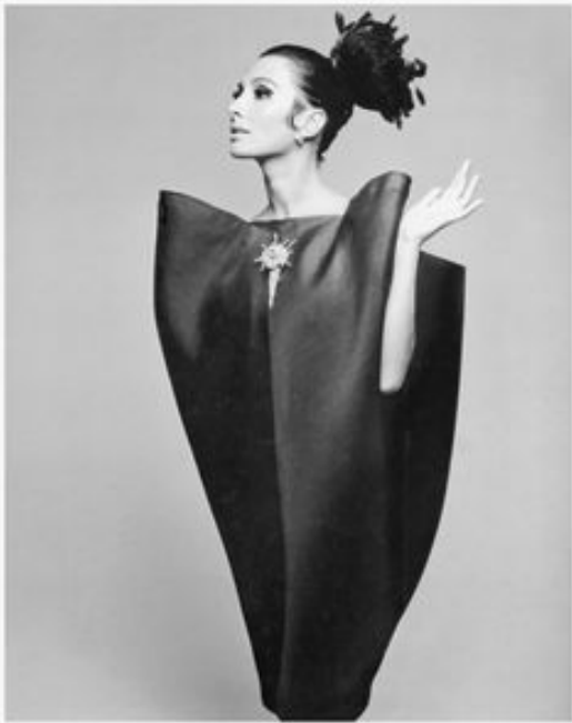
Balenciaga, Four Sided Dress, 1967

This image appeared in the Washington Post obituary on August 31, 2021.