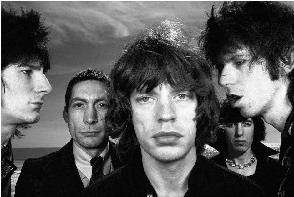
The Rolling Stones, 1976, Original “Black and Blue” Album Cover

Here is a rare chance to see an image in both color and monochrome. Which do you think it more effective?