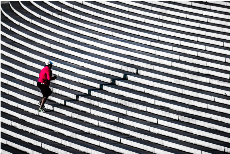
Stan Collyer- People in Action “Stepping Up”